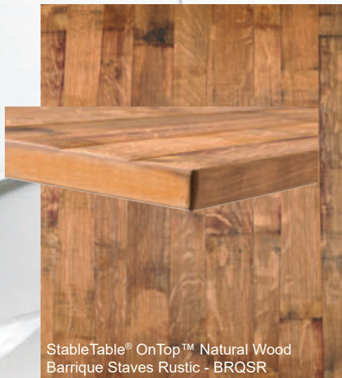
StableTable® OnTop™ Natural Wood Barrique Staves Rustic - BRQSR