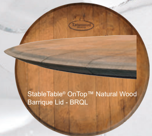
StableTable® OnTop™ Natural Wood Barrique Lid - BRQL