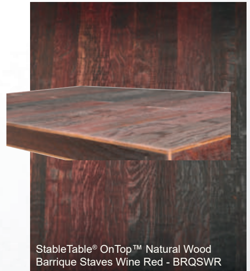
StableTable® OnTop™ Natural Wood Barrique Staves Wine Red - BRQSWR