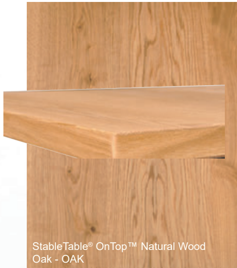
StableTable® OnTop™ Natural Wood Oak - OAK