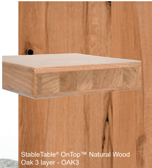
StableTable® OnTop™ Natural Wood Oak 3 layer - OAK3